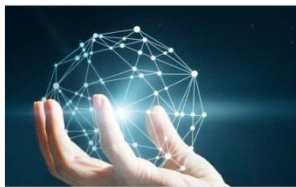
Merit Scholarship Programme (MSP) for High Technology