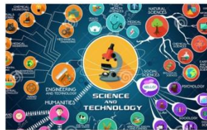
M.Sc Scholarship Programme in Science and Technology for IDB Least Developed Member Countries (MSc)